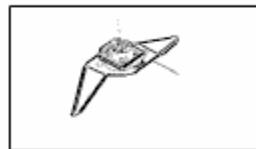
1 Schneidmesser / Cutting Blade